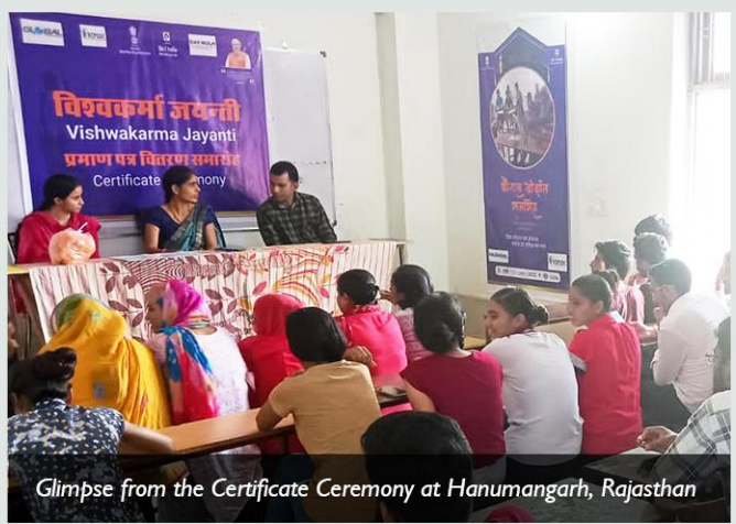
Glimpse from the Certificate Ceremony at Hanumangarh, Rajasthan

RCPSDC training partners celebrated #KaushalDeekshantSamaroh by conducting Convocation Ceremony for the candidates trained in STT for Material Handling Storage Operator job role at Hanumangarh, Rajasthan. During the training the candidates were trained for the proper storage and handling of the material. The candidates were made aware about the technical knowledge as well as the company/organization processes of the job role. The training was provided under DAY-NULM scheme to 40 Candidates.