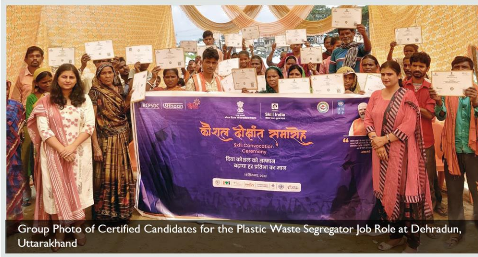
Group Photo of Certified Candidates for the Plastic Waste Segregator Job Role at Dehradun, Uttarakhand

Utthaan project involves up-skilling and certification of Plastic Rag pickers/ Waste collectors & segregators . The project involves the introduction of the latest tools and equipment in the Industry for the beneficiaries besides encouraging and motivating trainees to use the latest tools and equipment so as to enhance the earnings of the existing Plastic Rag pickers/ Waste collectors & segregators.