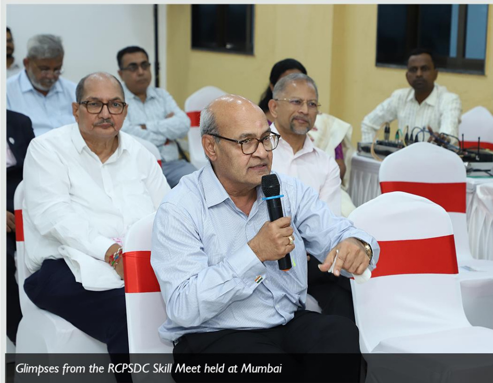
Glimpses from the RCPSDC Skill Meet held at Mumbai

Plastic Industry looks to triple in size in 6-7 years generating huge demand for workforce