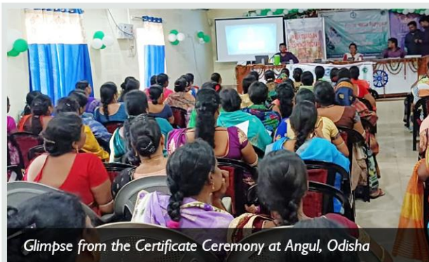
Glimpse from the Certificate Ceremony at Angul, Odisha

Another Skill Convocation Ceremony took place at Odisha, for the candidates who had successfully completed RPL training for Plastic Waste Segregator job role. The training upgraded