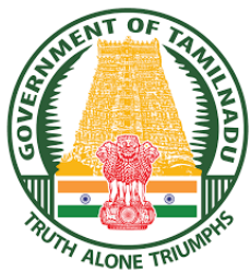
Tamil Nadu State Skill Mission