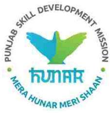
Punjab Skill Development Mission