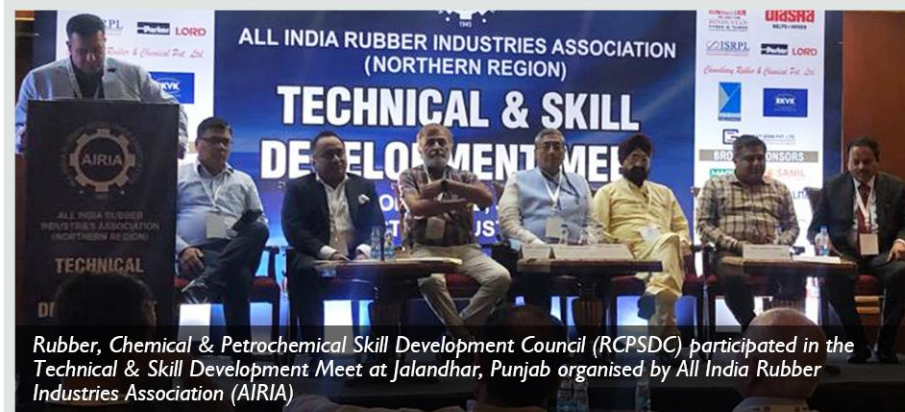
Rubber, Chemical & Petrochemical Skill Development Council (RCPSDC) participated in the Technical & Skill Development Meet at Jalandhar, Punjab organised by All India Rubber Industries Association (AIRIA)