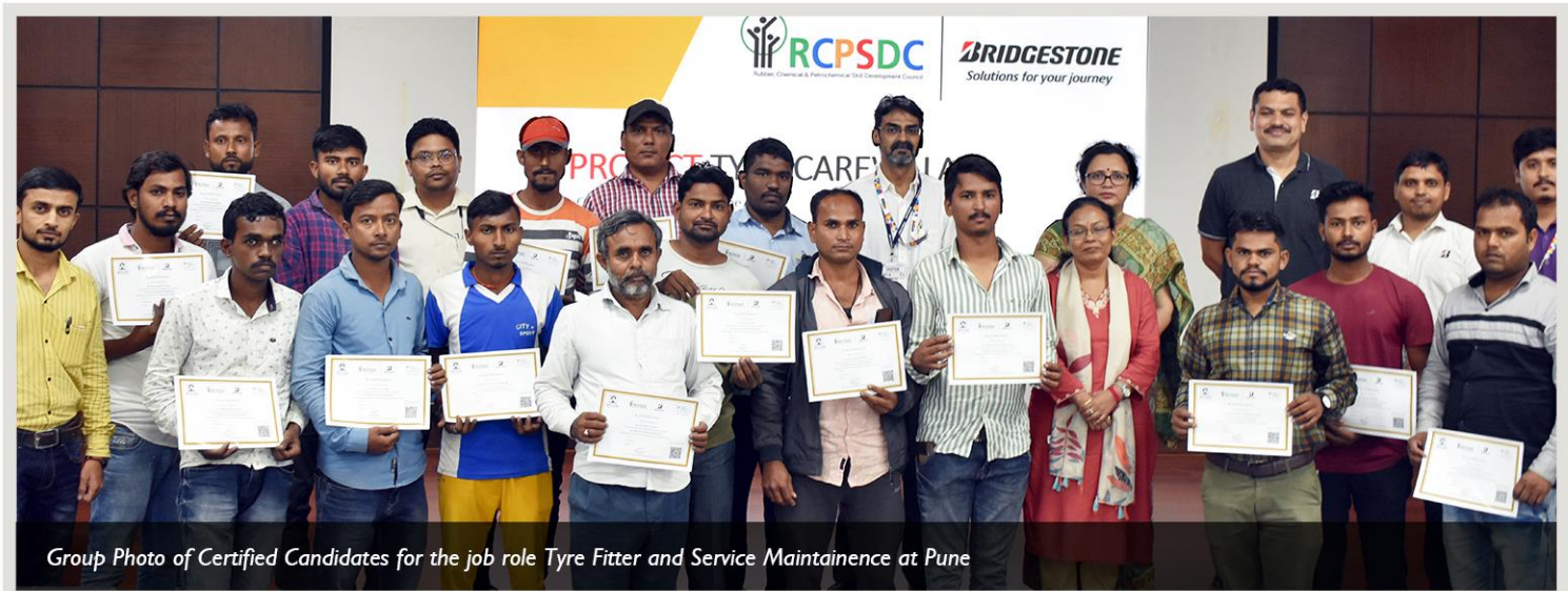
Group Photo of Certified Candidates for the job role Tyre Fitter and Service Maintenance at Pune

For a tyre mechanic who has never been formally trained, it's a sheer morale booster and an ennobling experience to get certified and recognised for the skills that he has acquired. Such was the uplifting sentiment at the certificate ceremony of tyre fitters at Pune who underwent upskilling by RCPSDC under the CSR project of Bridgestone India.