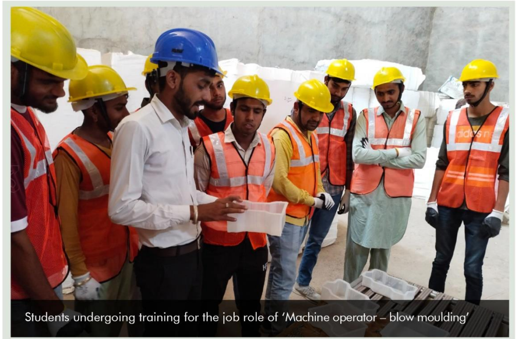
Students undergoing training for the job role of 'Machine operator – blow moulding'

Most of the trainings will take place in the Hanumangarh District where 600 candidates will undergo training for the job role of Machine Operator-Plastics Recycling and nearly equivalent number in Machine Operator – Blow Moulding in the district.