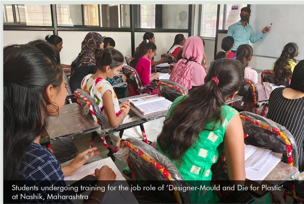
Students undergoing training for the job role of 'Designer-Mould and Die for Plastic' at Nashik, Maharashtra

Maharashtra State Skill Development Society (MSSDS) under the Government of Maharashtra has engaged the Rubber, Chemical & Petrochemical Skill Development Council (RCPSDC) for skill training of disadvantaged communities in the lucrative newly approved job roles in the plastic industry. Having interacted closely with the Plastic industry and understanding their requirements for individuals trained in specific skills, RCPSDC has diligently created course content for skill training in new and approved job roles in the Plastic sector.