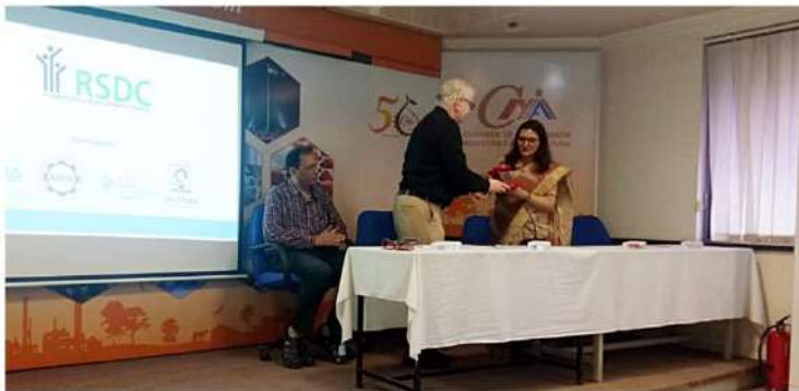
NAPS workshop conducted during Apprenticeship Pakhwara in Aurangabad