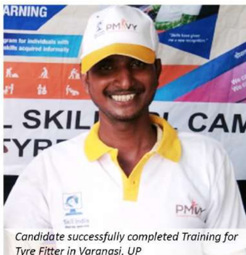
Candidate successfully completed Training for Tyre Fitter in Varanasi, UP