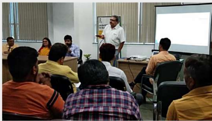
RSDC organized a NAPS Workshop on 3rd Oct 2019 at Bahadurgarh, Haryana

long way in helping individuals get an opportunity for apprenticeship and eventually a placement for deserving candidates.