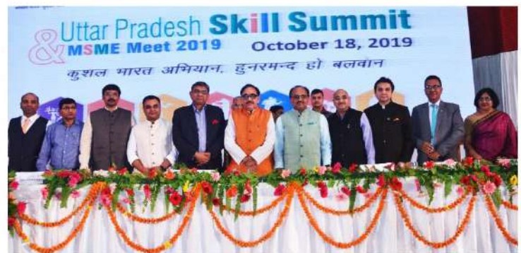
UP Skill Summit and MSME Meet 2019 in Lucknow

At the recently held Uttar Pradesh Skill Summit & MSME Meet, Rubber sector attracted wide attraction as an area with immense possibilities for value addition through skilling.