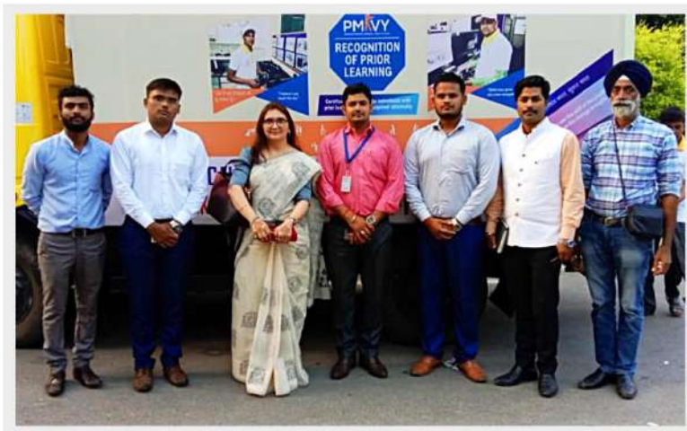
RSDC Mobile Van display during the UP Skill Summit on 18 Oct 2019