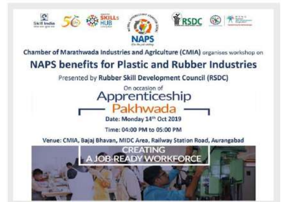
RSDC conducted the NAPS Workshop organized by CMIA on 14th Oct 2019 at Aurangabad, Maharashtra