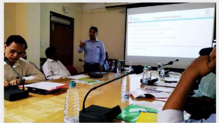
RSDC participated in a NAPS Workshop organized by Directorate of Skill Development Tripura on 10 Oct 2019 at Tripura, Agartala

To begin with, RSDC in collaboration with NSDC has conducted a workshop on NAPS on 3rd Oct 2019 at Bahadurgarh, Haryana. The workshop was organised at Bahadurgarh Footwear Development Park. Numerous Footwear industries participated and have shown interest in the scheme. They also cleared their doubts regarding the scheme.