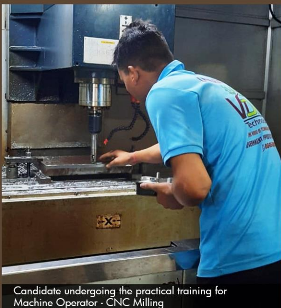
Candidate undergoing the practical training for Machine Operator - CNC Milling

The convocation ceremony of VDA Technologies, one of the leading training partners (TP) of RCPSDC for the plastics sector, witnessed the presence of a number of dignitaries from the Vasai Industries association where VDA Technologies is situated at the heart of industrial zone which enables them to train and place the candidates effortlessly.