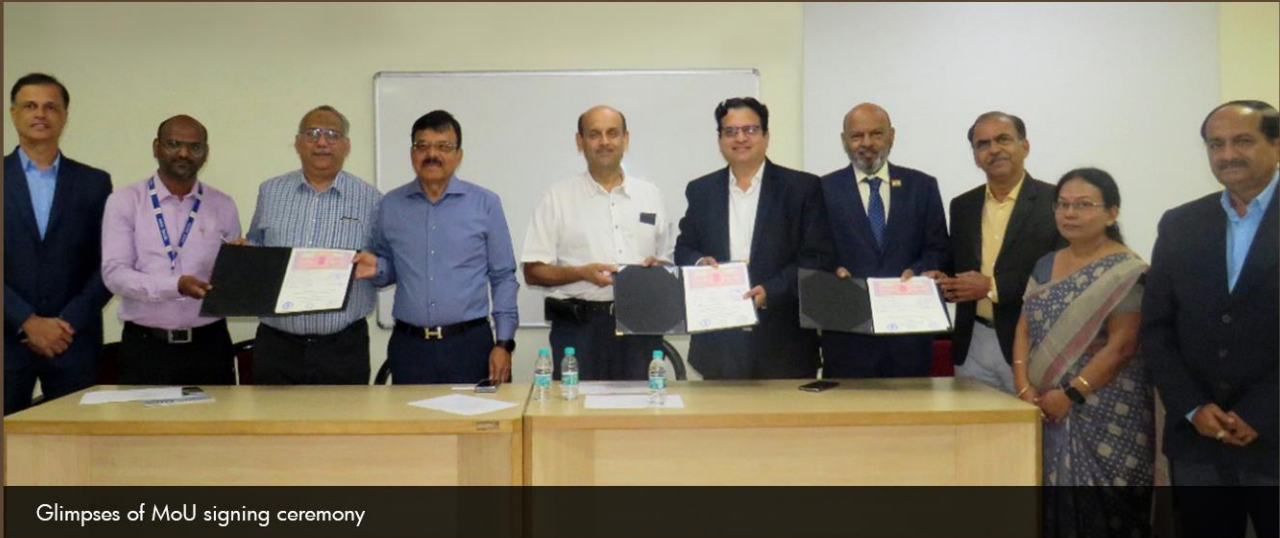
Glimpses of MoU signing ceremony

In a significant push to skill training in the field of Rubber, the Auto Cluster Development and Research Institute (ACDRI), Pune will soon have a Centre of Excellence for 'Rubber Industrial Skill Development. Rubber Chemical & Petrochemical Skill Development Council (RCPSDC), All India Rubber Industries Association (AIRIA) and Auto Cluster Development & Research Institute (ACDRI), Pune have joined hands through a tripartite arrangement for setting up the Centre of Excellence at ACDRI, Pune.