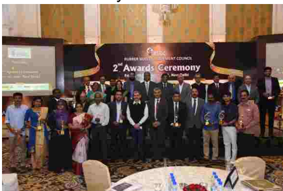
Winners of Awards Ceremony 2017