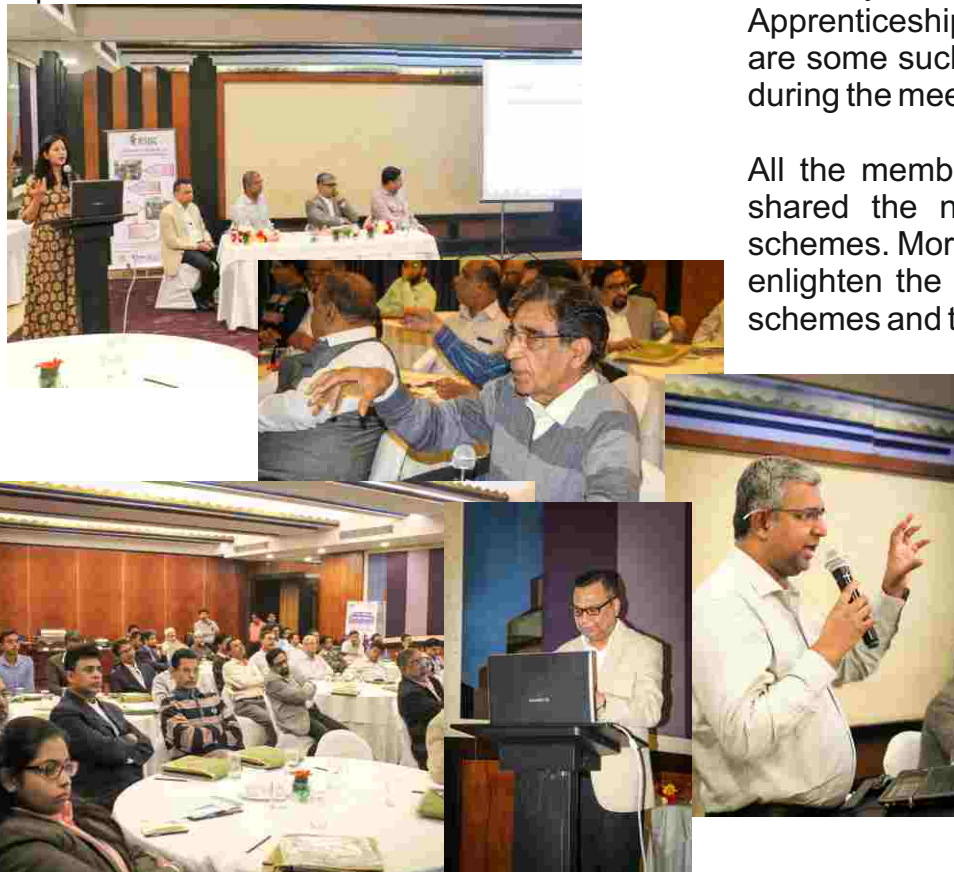
Glimpses of the Evening

All the members participated enthusiastically and shared the number of employees for the RPL schemes. More such Skill Meets will be organized to enlighten the industry about the skill development schemes and their benefits.