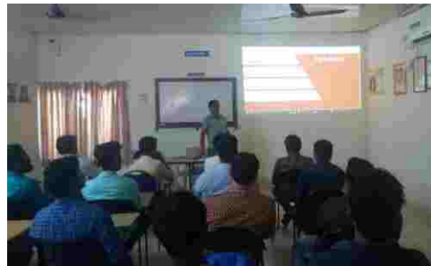
Training in Kerala under NBCFDC