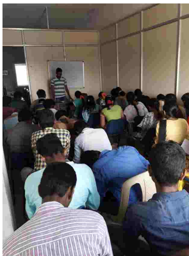
Classroom Training Under APSSC