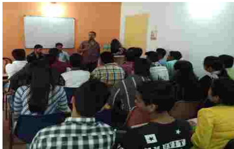
Training in Assam under NSFDC