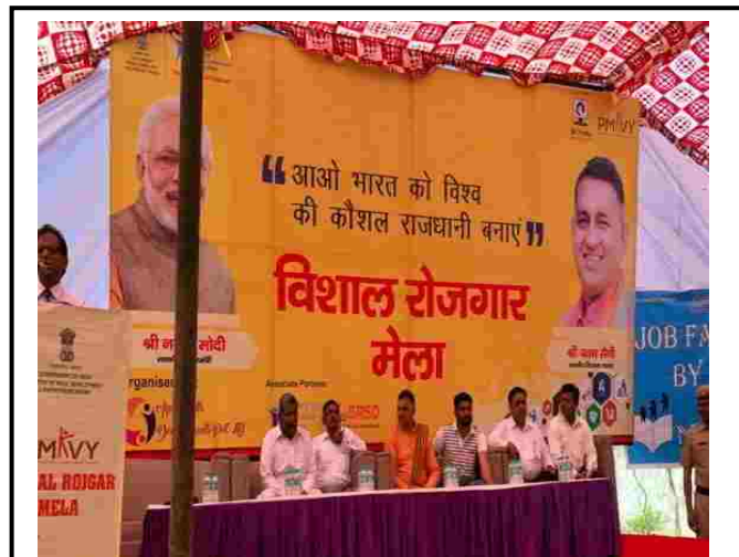
Dignitaries inaugurating the Rozgar Mela Left: Students make queue to register for the Rozgar Mela

More than 10 rubber companies participated in the event. Candidates and job aspirants from the