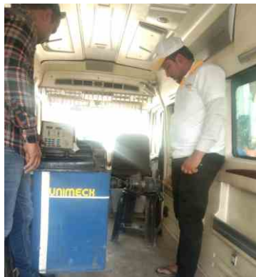
RPL of Tyre Fitter in Faridabad, Haryana