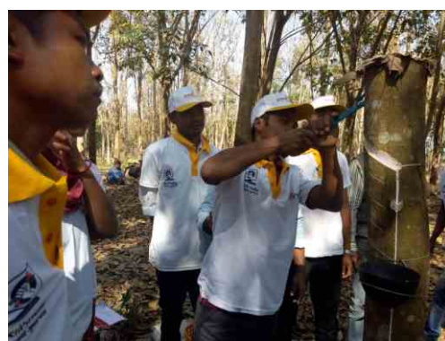
Latex Harvest Technician training in Udaipur, Tripura