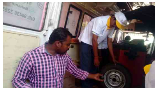
RPL of Tyre Fitter, in Karur, Tamil Nadu