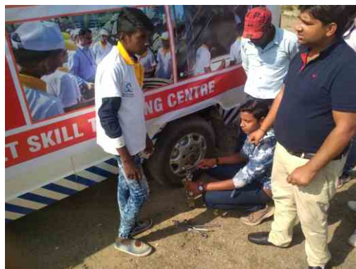
RPL of Tyre Fitter, in Purnia Bihar