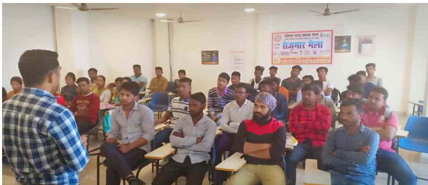
Job Fair in Udham Singh Nagar, by RSDC affiliated Training Partner, Sri Ram Skill Development Pvt Ltd