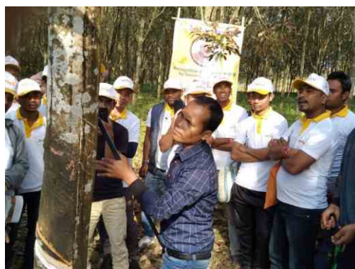
Latex Harvest Technician training in Kajalgaon, Assam