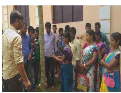
Rigpa Edusolution's RPL training programme under RSDC sponsored by NSCFDC at South Tripura.