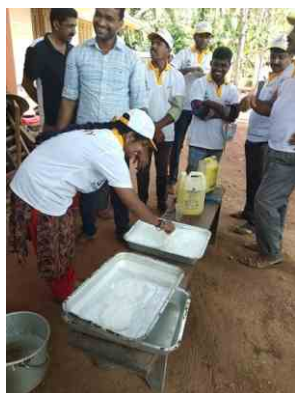
Processing Technician-Rubber Sheeting training in Dakshina Kannada, Karnataka