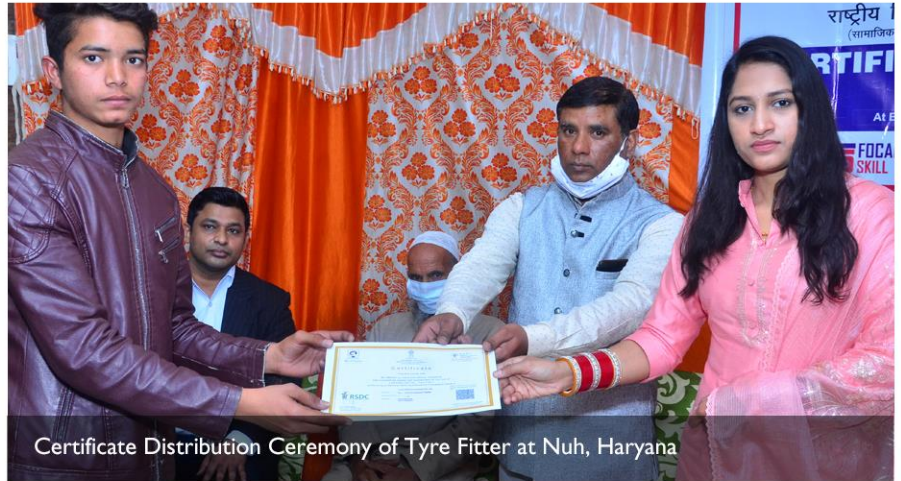
Certificate Distribution Ceremony of Tyre Fitter at Nuh, Haryana

The Short Term training program has not only led to placement for a large number of trainees but has also spawned several entrepreneurs. Methodically trained tyre fitters will also help make road transport safer.