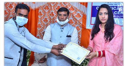
Certificate Distribution Ceremony of Tyre Fitter at Nuh, Haryana