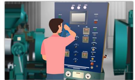
An animation demonstrating the panel cleaning of machines within industry