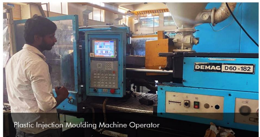
Plastic Injection Moulding Machine Operator

The Employment through Skill Training & Placement (EST&P) Component under NULM is designed to provide skills to the unskilled urban poor as well as to upgrade their existing skills. The programme provides for skill training of the urban poor to enable them to set up self-employment ventures and for salaried jobs in the private sector. The EST&P Programme intends to fill the gap between the demand and availability of local skills by providing skill training programmes as required by the market.