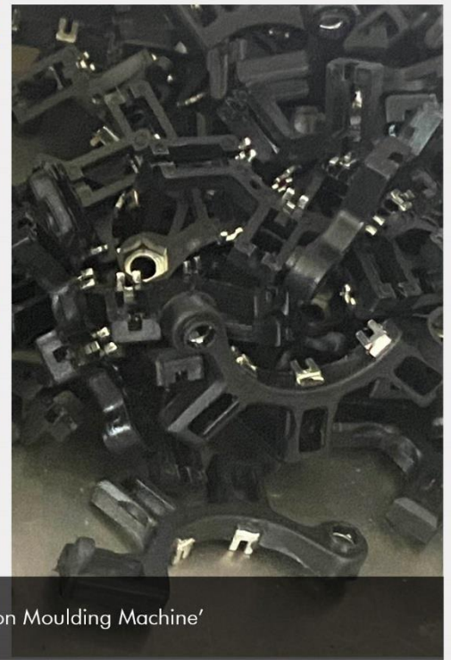
The process of plastic processing being done with the help of ' Injection Moulding Machine'

RCPSDC has been mandated with a work order under the aegis of Kudumbashree & State Urban Livelihoods Mission (SULM), Kerala . Kudumbashree is the poverty eradication and women empowerment programme implemented by the State Poverty Eradication Mission (SPEM) of the Government of Kerala.