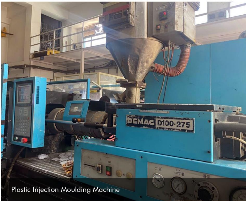
Plastic Injection Moulding Machine

KUDUMBASHREE STATE POVERTY ERADICATION MISSION, GOVT. OF KERALA