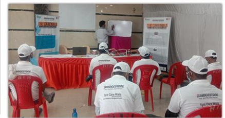
A Training Class Progress with the Commercial Tyre Fitters kanpur