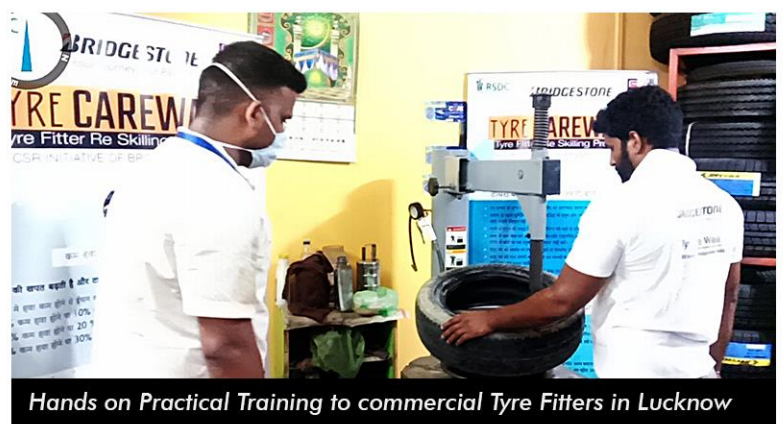
Hands on Practical Training to commercial Tyre Fitters in Lucknow

Uttar Pradesh, Haryana, Punjab, Maharashtra, Gujarat and Madhya Pradesh. The aim of the project was to provide skill development training to 1000 individuals in commercial tyre fitting & repair job role. The tyre fitters were provided with an in-depth knowledge about the safety aspects, technicality of products, best practices and soft-skills.