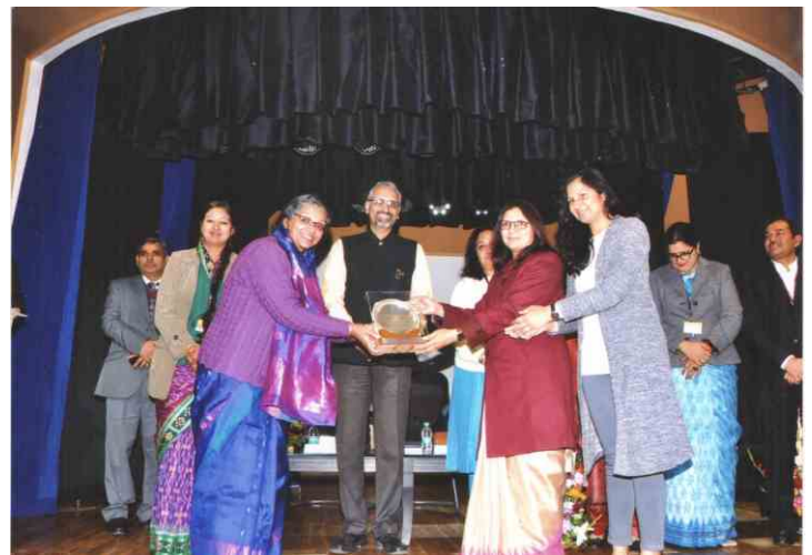
Joint Secretary, Ministry of Social Justice & Empowerment, Managing Director, NBCFDC presenting the award to CEO, RSDC and Sr. Director, RSDC.