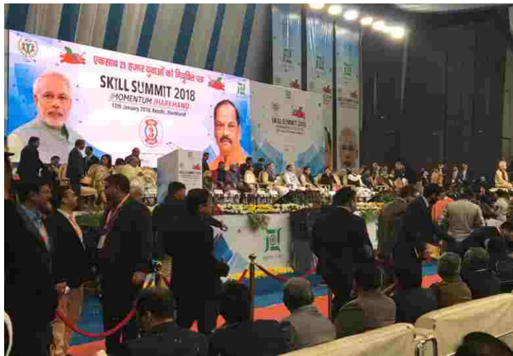
Jharkhand Skill Summit

Government of Jharkhand has put Skill Development at the forefront of all development activities in the State. Jharkhand Skill Development Mission Society (JSDMS) aims to establish Jharkhand as the “Skill Hub of India” in the next five years. As a proud partner of JSDMS, RSDC has aligned its agenda to contribute to the larger skill mission of the state.