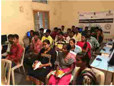
Training in Telengana