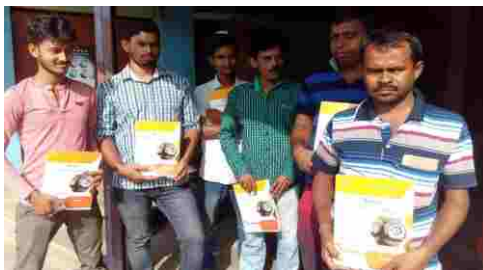
Training in Agartala and Dharmnagar