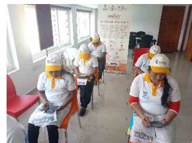
RPL Training for manufacturing sub-sector in Anand Motors, Gurgaon, Hayrana