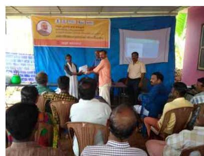
RPL Training for plantation sub-sector in Kasargod, Kerala and Udaipur, Assam