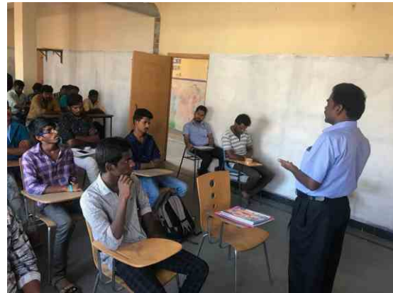
Rozgar Mela in Mehbub-nagar

RSDC, in collaboration with its training partner, Master Mind Solutions, recently organized a Rozgar mela-cum-briefing session on the emerging opportunities in the Rubber sector. The Rozgar mela was organized on 30th Oct 2018 at Mahbub Nagar, one of the most populous districts in the southern state of Telangana. The mela was an initiative by SSC (RSDC) itself.