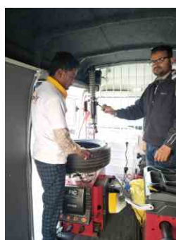
RPL Training for Tyre Service & Maintenance in Vidisha, Madhya Pradesh