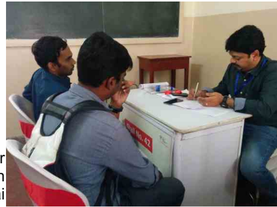
Rozgar Mela in Mumbai

Paragon Industries, one of the prominent rubber products manufacturers, was the key employer in the mela. 42 candidates participated in the rozgar mela and 22 candidates were shortlisted by these industries. With an average salary of Rs 10,000 per month. The positions are based at Patancheru, Hyderabad.