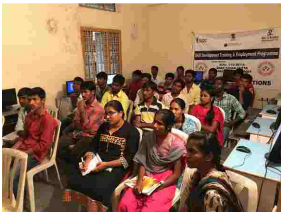
Classroom training in Kurnool, AP