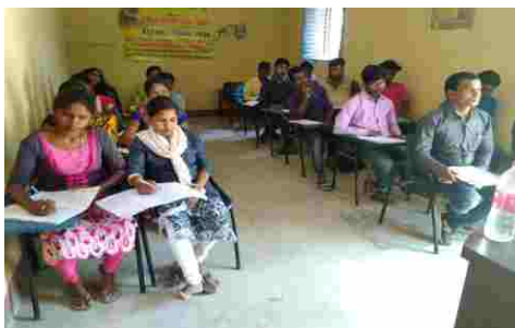
Training in Ranchi, Jharkhand under NSFDC