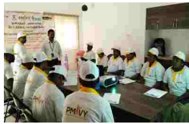
Veegrip Belts, Madurai