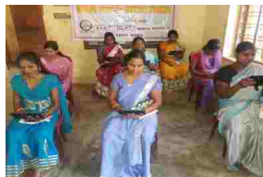
Rubber Nursery General Worker, Kanyakumari