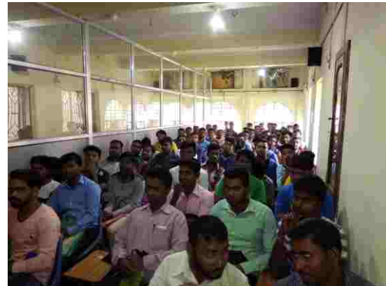
Classroom training in Hoogly, West Bengal

Under the terms of the MoU, RSDC will implement National Skill Qualification Framework (NSQF) aligned Skill Development Training Programmes sponsored by NSFDC. RSDC will ensure that candidates who are not already employed in the sector are the actual beneficiary of skilling programme under this MoU.