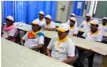
Jayshree Polymers, Pune