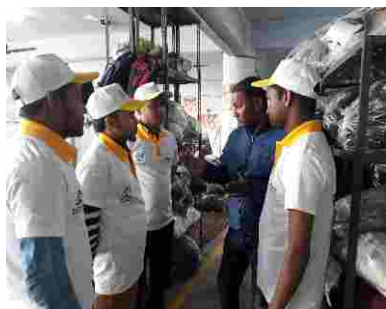
Aerobok Shoes, Jhajjar