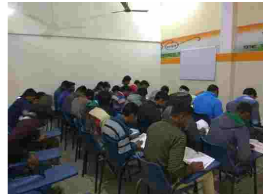
Classroom training in Gohana, Haryana