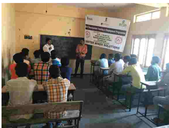
Classroom training in Mahabubnagar, Telengana

RSDC was awarded 1260 numbers for the fresh training in the rubber sector. The trainings are being conducted across the country. RSDC Affiliated Training Partners have enthusiastically stepped up to be a part of this project.