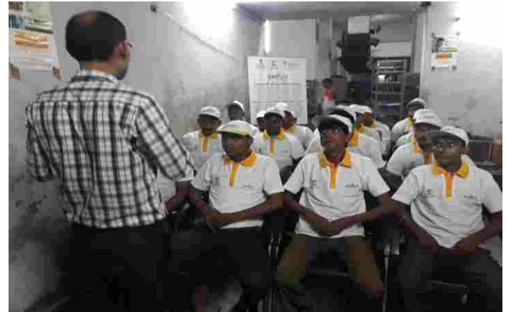
Classroom session of employees at Aerobok Shoes in Jhajjar, Haryana

Haryana State Industrial and Infrastructure Development Corporation Ltd (HSIIDC) and RSDC have entered into an understanding for Skill Development Initiatives in the fast emerging industrial state of the country. HSIIDC is the nodal agency for the development of industrial infrastructure in the State of Haryana. HSIIDC is also mandated to provide skill development trainings to the people in the areas around the industrial estates.