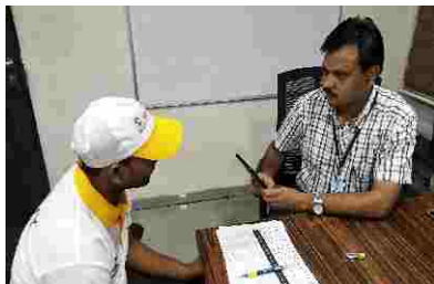
Gold Seal, Daman