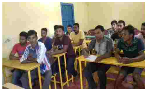
Training in Dharmnagar, Tripura under NBCFDC